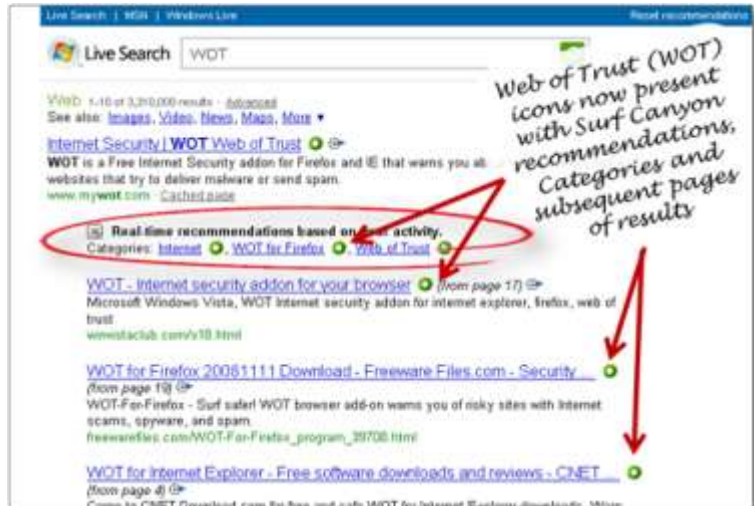
SurfCanyon uses WOT ratings for safe search

Read more and add your comment on the WOT blog .