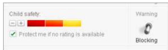
This is maximum protection for children.