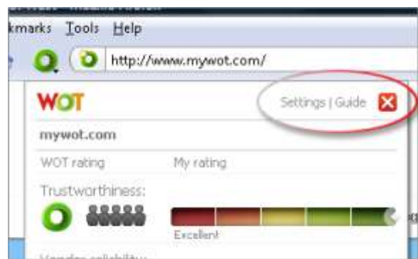
WOT settings can be accessed from the add-on.

Don't forget to click Apply settings at the bottom.