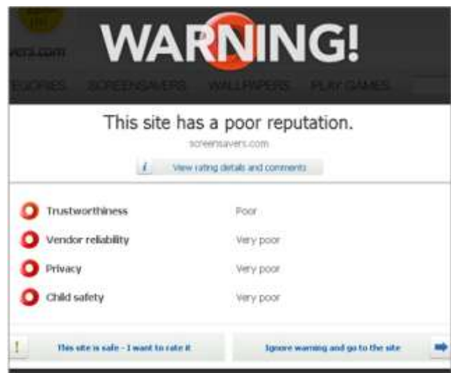
New design of WOT warning screen has more information.

A small but popular addition is the right click shortcut . Right click on any link and the menu includes the option to see the WOT scorecard. This is especially useful when you are surfing in a site with links but no WOT ratings. This feature is available only for Firefox users.