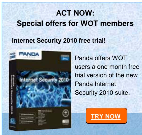
Panda-WOT cobranded add-on